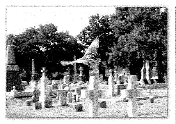
A beautiful majestic hawk made a visit to St. Mary's on a recent late summer's day.